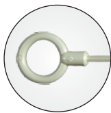
Thumbring for Better Grip